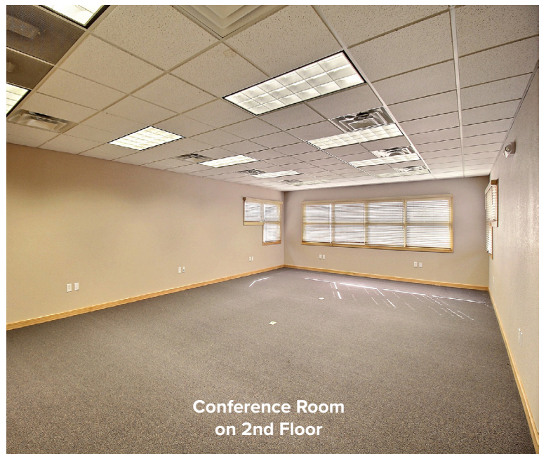
Conference Room on 2nd Floor